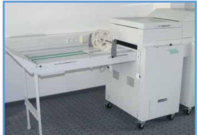
NAGEL TRIMMER 100 – with long delivery conveyor

■ The long delivery conveyor comes as standard with the Foldnak 100 and Foldnak 80 and is compatible with the Trimmer 100 and the SP Plus Online.