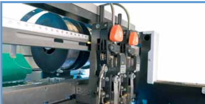
NAGEL FOLDNAK 100 – wire stitching heads

■ The Foldnak 100 provides a productive and efficient solution for professional finishing. The modern bookletmaker comes with valuable features: an automatic format set-up, easy handling and an extraordinary wide range of sheet sizes. The largest format currently available (364 x 521 mm) of modern digital printing presses can be handled as easily as particular small formats (105 x 148.5 mm). Thanks to the variety of formats and functions, booklets of different sizes and grammages can be produced. Bookletmaking, block stapling or just folding – finishing with the Foldnak 100 is simply versatile.