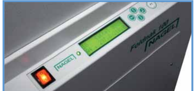
NAGEL FOLDNAK 100/80 – fast and easy operation

■ The Foldnak 80 is designed specifically for the needs of digital printers. The basic and solid construction is almost identical to the Foldnak 100, but this bookletmaker comes with 5000 staples per cartridge which are easy to change. Digital stock of different grammages is fed with ease and reliability.