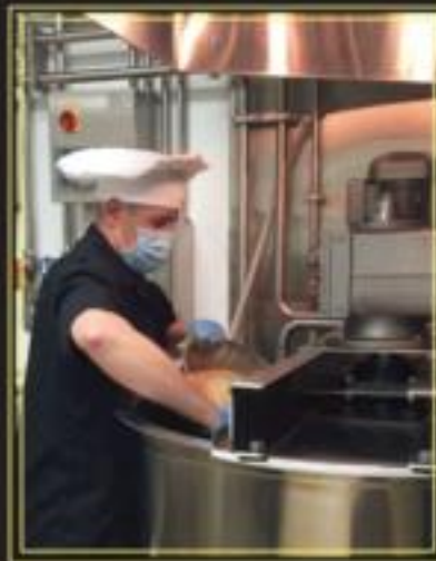
Flexibility of packaging and products.