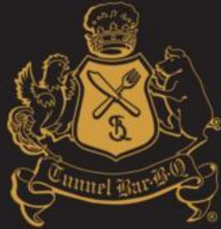
Historic pig & chicken logo from original sign.