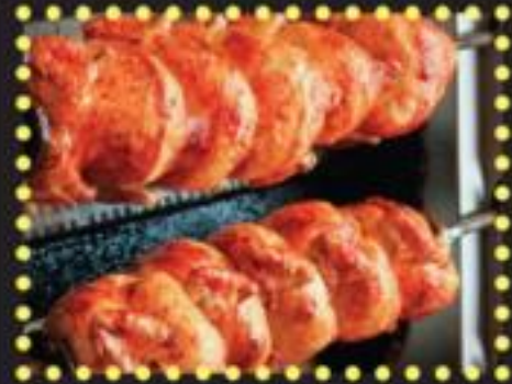
Food service spice blends and procedures training.