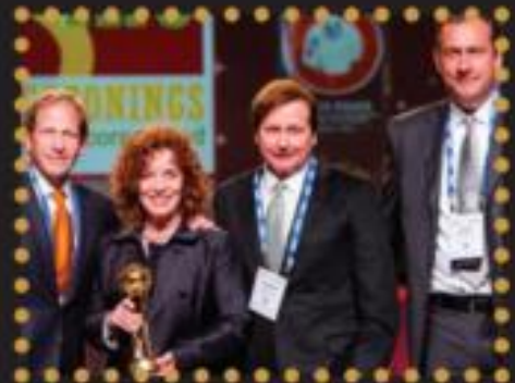
Winner, Canadian Grand Prix Award, 2015