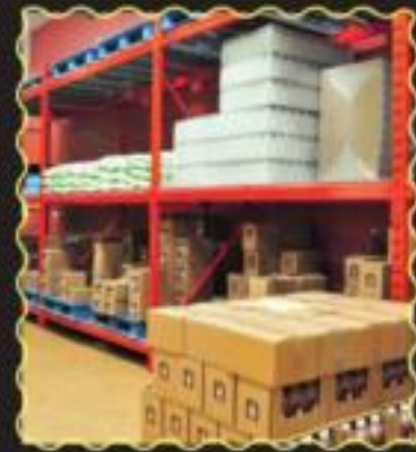
Warehousing and logistics for products that are ready to ship.