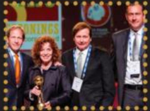
Winner, Canadian Grand Prix Award, 2015