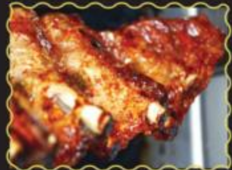
Dry rub ribs, triple basted.