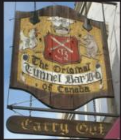
Original sign, 1941