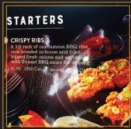
Guest appearance on Swiss Chalet menu, 2017