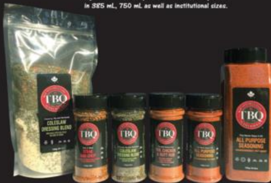
A full line of prepared TBQ Spice blends in a variety of sizes for retail and food service.