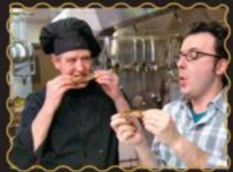
"You Gotta Eat Here" with John Catucci, 2011