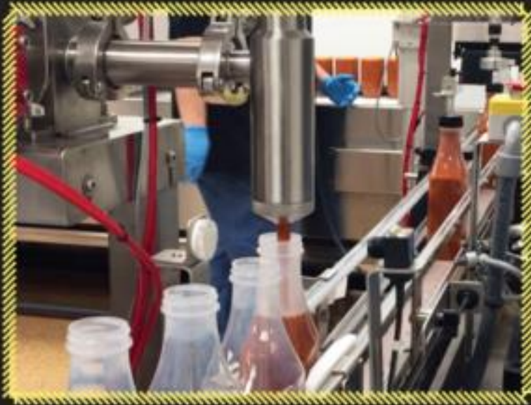
FSSC 22,000 certified for retail, big box and food service production.

HACCP Factory equipped, staffed and ready to go.