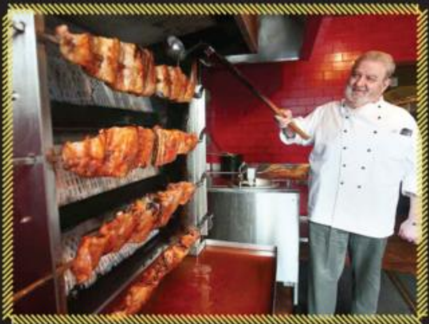
Authentic chef training for preparation of signature TBQ rotisserie ribs.