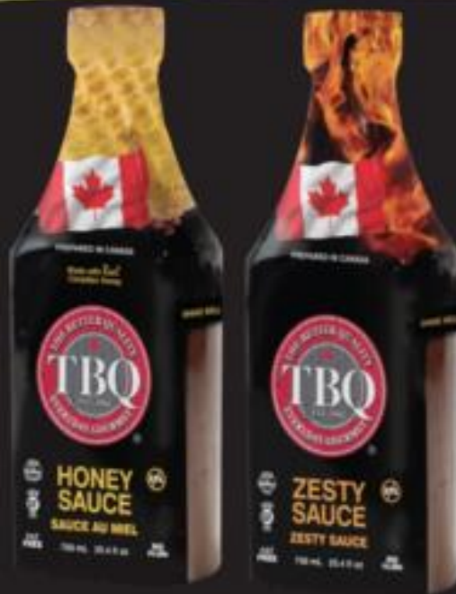
Signature TBQ Honey Sauce and TBQ Zesty sauce in 385 mL, 750 mL as well as institutional sizes.

A full line of products for retail and table service.