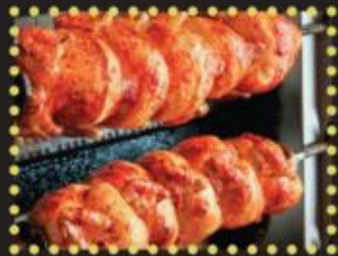
Signature rotisserie TBQ chicken.