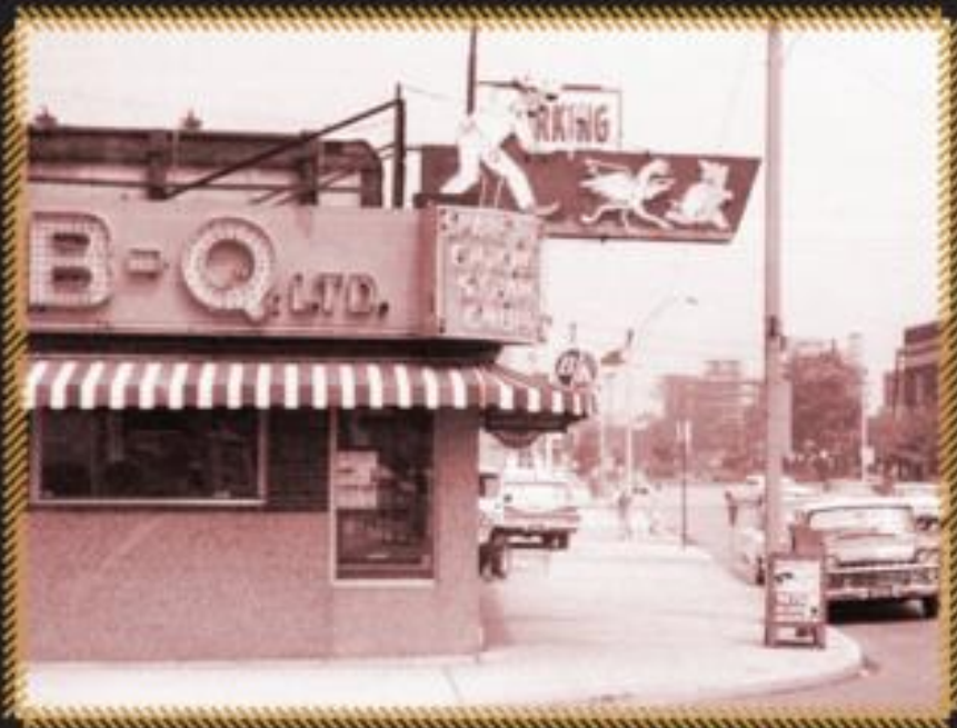
TBQ Restaurant, Windsor, 1944