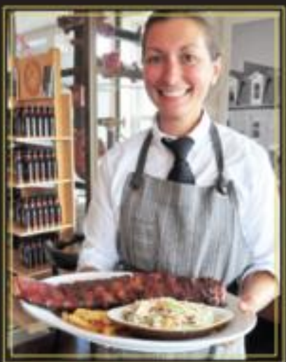
TBQ meal presentation with signature TBQ Colelaw and crinkle cut fries.