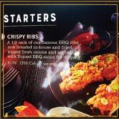
Guest appearance on Swiss Chalet menu, 2017