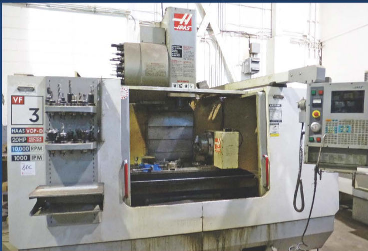
2003 HAAS CNC machining centre, model VF-3D