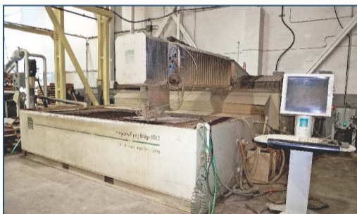
2005 FLOW CNC waterjet, model IFB-6012