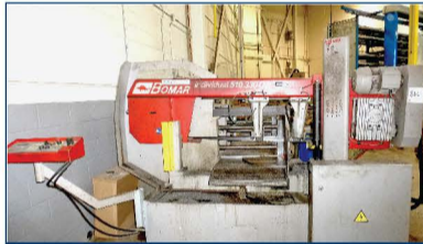
2004 BOMAR automatic bandsaw, model Individual 510.330GA