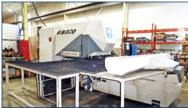
2004 HACO CNC turret punch, model Omatic 212-RH