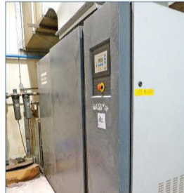
2006 ATLAS COPCO 75 h.p. compressor, model GA55-Plus-FF