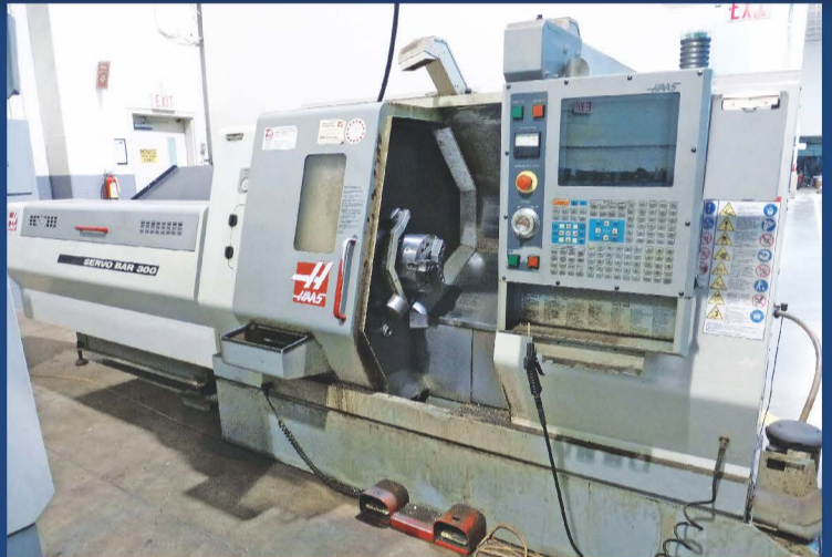
2002 HAAS CNC turning centre, model SL-20TB