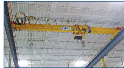
2007 O'BRIEN 10-ton crane, 29' span