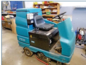
2007 TENNANT floor scrubber, model M7100