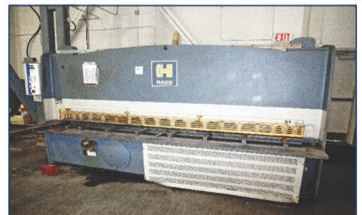
2003 HACO 10' x 1/4" power shear, model HSLX-3006