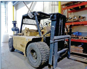
TOWMOTOR diesel forklift truck, 24,000 lbs. cap.