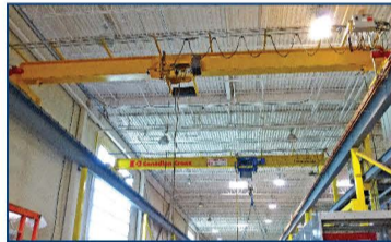
2006 CANADIAN & 2007 O'BRIEN 10-ton cranes, 35' span