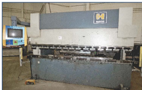
2003 HACO 10' x 135 ton CNC press brake, model ERM-30135