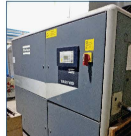
1999 ATLAS COPCO 67 h.p. compressor, model GA50-VSD