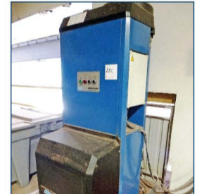
2006 NEDERMAN 19.7 h.p. high vacuum system, model E-Pak 500