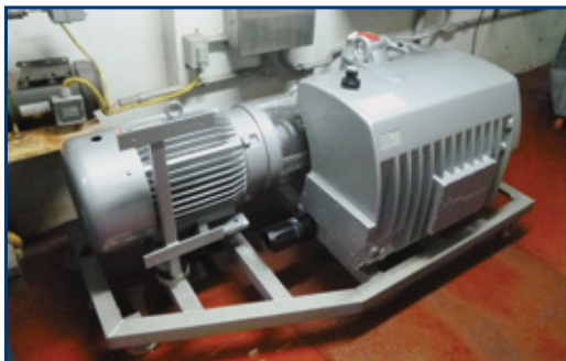
BUSCH 25 h.p. vacuum pump, (1 of 35)