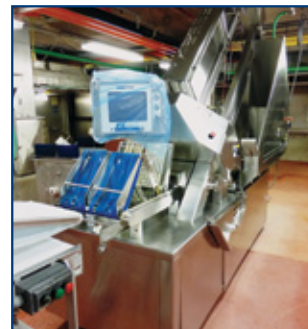
FORMAX slicer, model 180, (1 of 2)