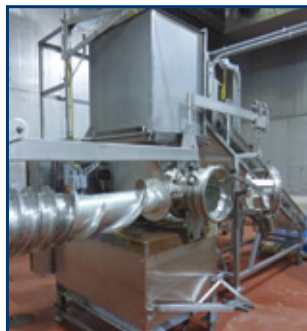
WEILER 16" grinder, model 1675