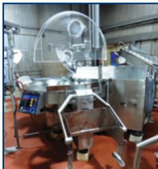
KRAMER GREBE 500 liter bowl cutter, (1 of 2)