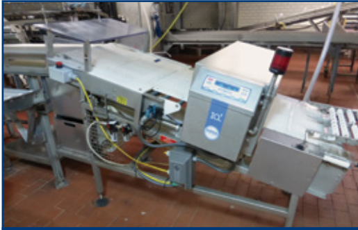
LOMA s/s metal detector, (1 of 15)