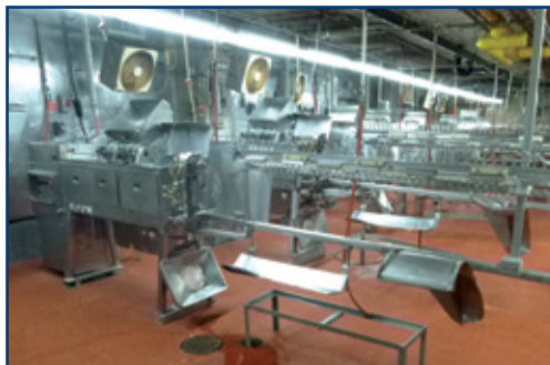
(8) STUART stuffing-linking-hanging lines