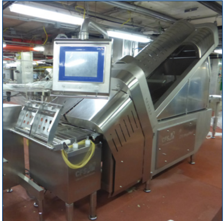
CFS slicer, model MegaSlicer, (2008)