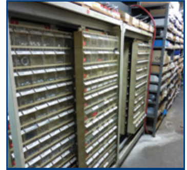
Large quantities of stores, spare parts, & supplies, etc.