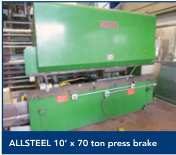
ALLSTEEL 10' x 70 ton press brake