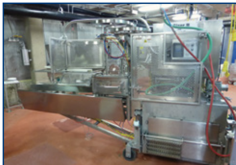
TEEPAK T-Sizer clipper II, model 4, (1 of 2)