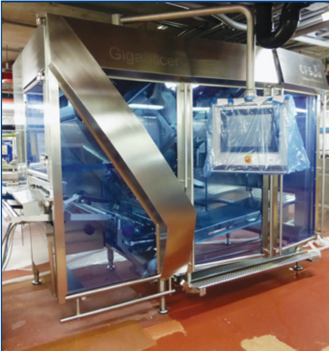
CFS slicer, model GigaSlicer, (2011)