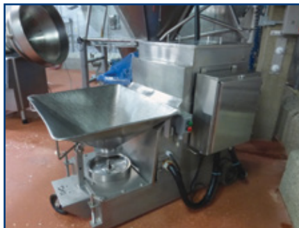
COMVAIR emulsifier, (1 of 5)