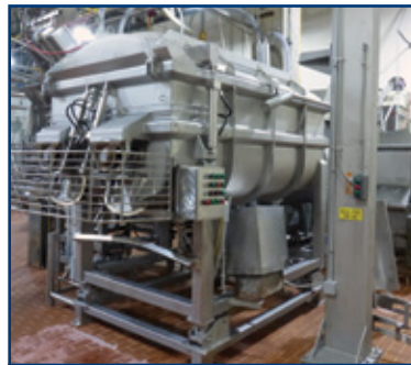
Vacuum ribbon blender, (approx. 5,000 lb.), (1 of 4)