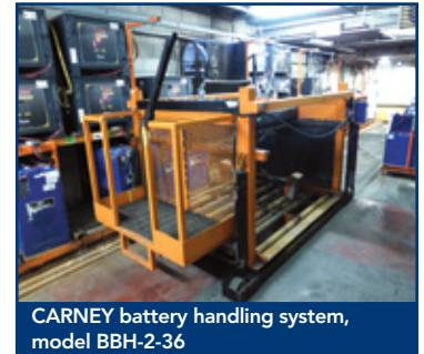
CARNEY battery handling system, model BBH-2-36