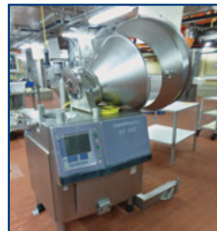
HANDTMANN vacuum stuffer, model VF300, (1 of 6)