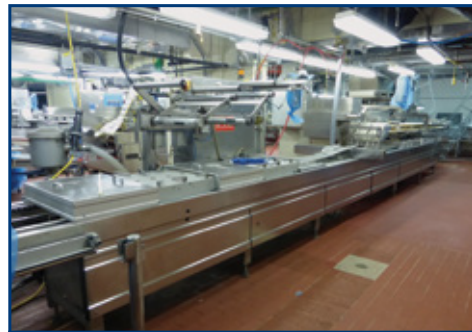
MULTIVAC vacuum packaging machine, model R530