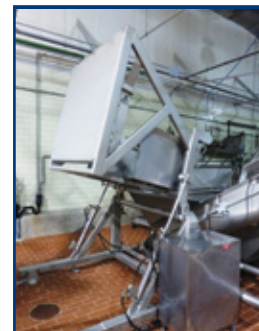
Hydraulic s/s bin & buggy dumpers, (1 of 35)