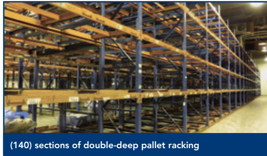
(140) sections of double-deep pallet racking