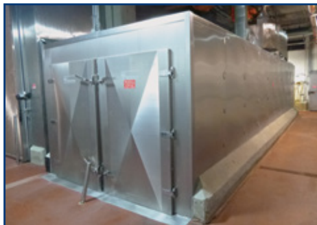
SCHROTER s/s batch smoke house, (1 of 3)