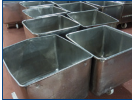
(125) VEMAG s/s buggies