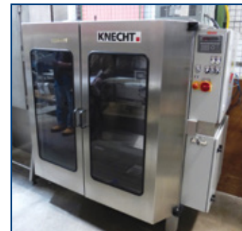
KNECHT blade grinder, model A950, (2011)