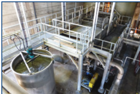
POSEIDON PPM Clarifier s/s skimmer tank system, model PPM-200CB