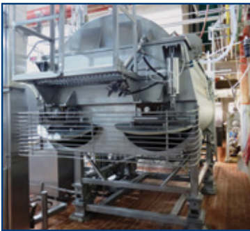
RMF vacuum ribbon blender/massager, model 28-8000, (approx. 8,000 lb.)