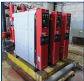
DOMNICK HUNTER air drier model DHS110DS, (2011)