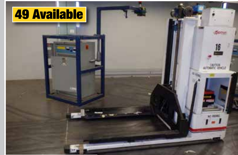
View of Egemin Laser Guided Vehicles