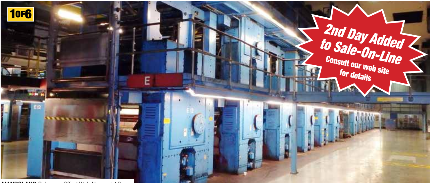
MANROLAND Colorman Offset Web Newsprint Press