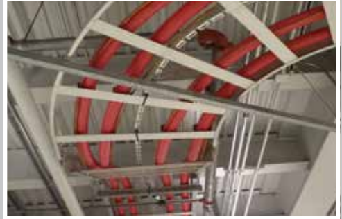
Partial View of Tech Cable and Spare High Voltage Switch Gear