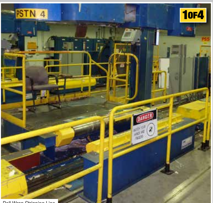
Roll Wrap Stripping Line