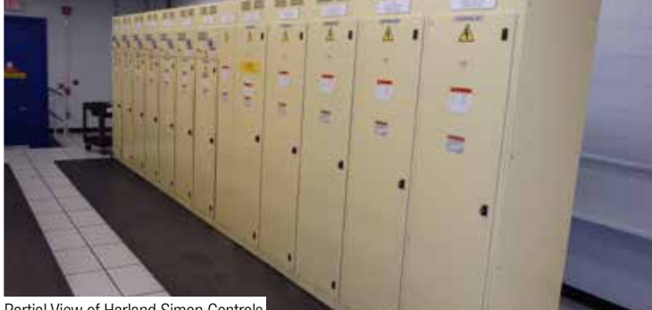
Partial View of Harland Simon Controls