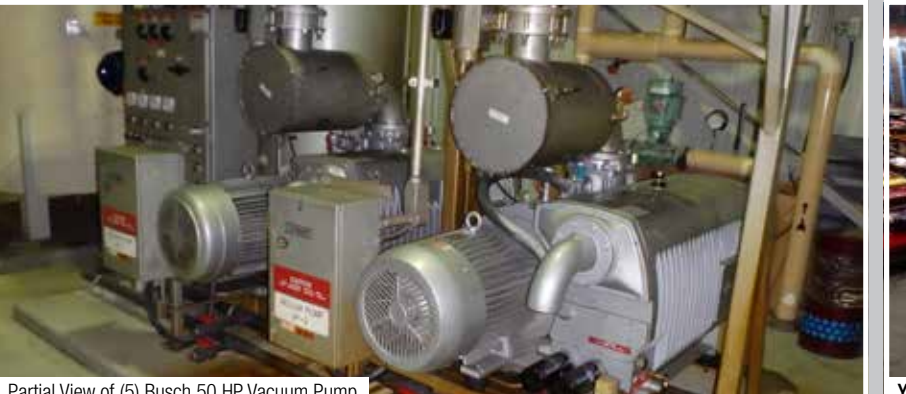
Partial View of (5) Busch 50 HP Vacuum Pump

• (4) Assorted Poly Holding Tanks JWI • (20) Panel Filter Press • (3) Parts Washers 1998 SpinKlene 1100PL Centrifuge