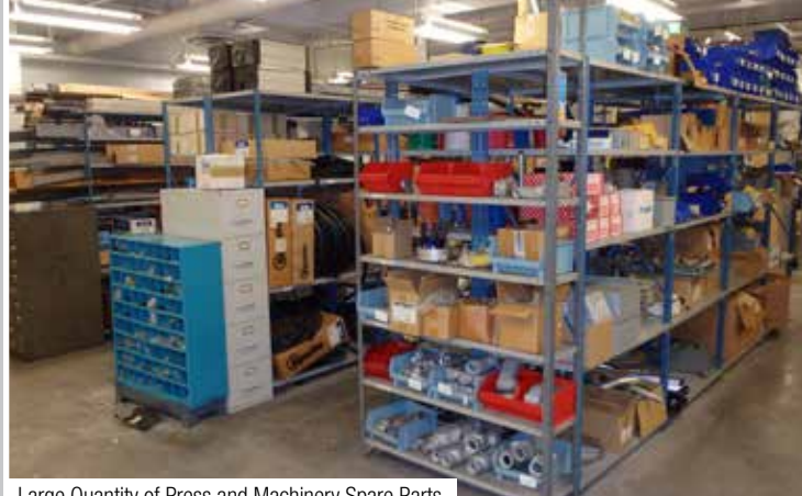
Large Quantity of Press and Machinery Spare Parts