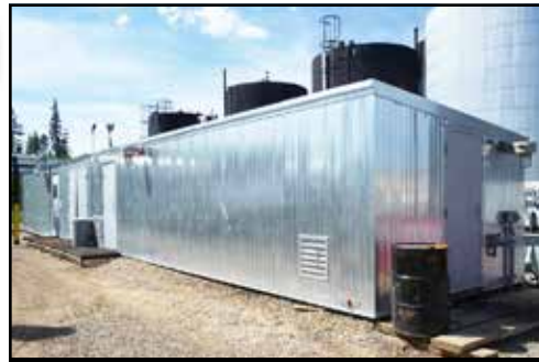
BIG FOOT 72'x12' Skidded Pump Building & Cut Shack