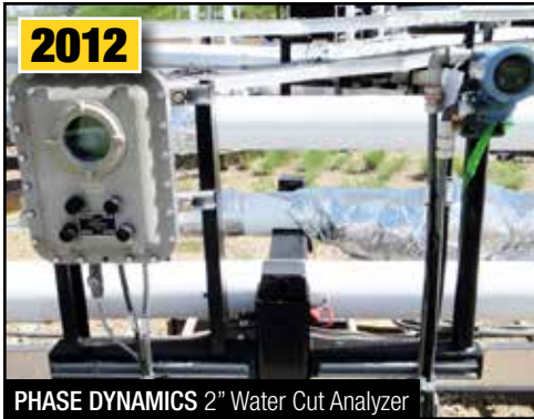
PHASE DYNAMICS 2" Water Cut Analyzer