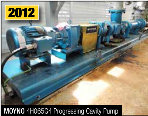
MOYNO 4H065G4 Progressing Cavity Pump