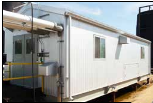
STRAIGHT UP Skidded Pump & Meter Building