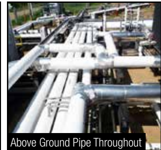
Above Ground Pipe Throughout