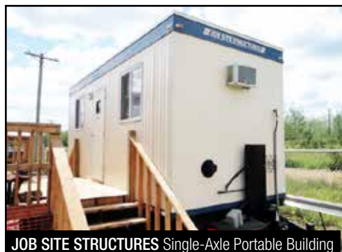
JOB SITE STRUCTURES Single-Axle Portable Building

VIEW VIDEOS OF THE PROCESSING FACILITY: www.youtube.com/user/TCLAssetGroupInc