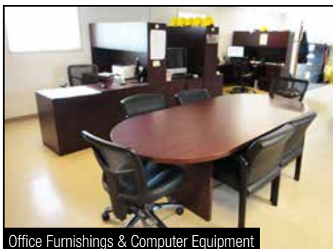
Office Furnishings & Computer Equipment