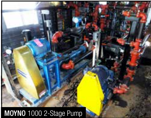
MOYNO 1000 2-Stage Pump