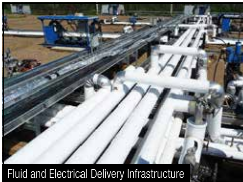
Fluid and Electrical Delivery Infrastructure