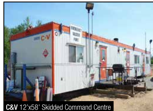
C&V 12'x58' Skidded Command Centre