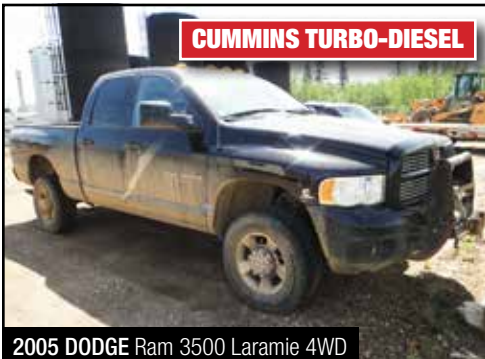
2005 DODGE Ram 3500 Laramie 4WD