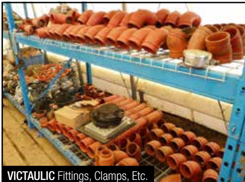
VICTAULIC Fittings, Clamps, Etc.