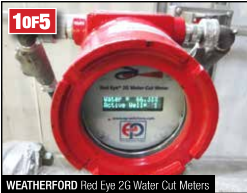
WEATHERFORD Red Eye 2G Water Cut Meters