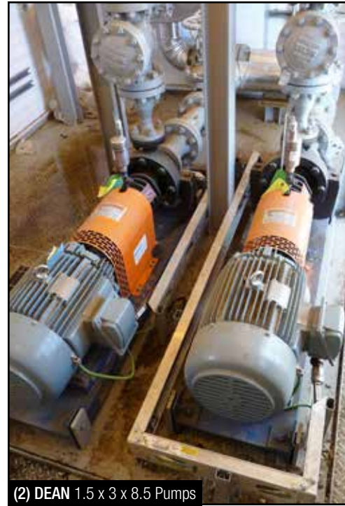
(2) DEAN 1.5 x 3 x 8.5 Pumps