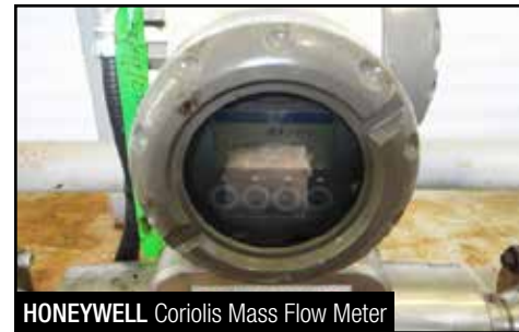
HONEYWELL Coriolis Mass Flow Meter