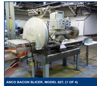
ANCO BACON SLICER, MODEL 827, (1 OF 4)