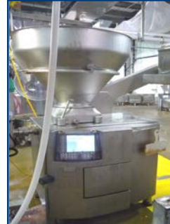
HANDTMANN STUFFER, MODEL VF630, C/W HOIST, (1 OF 2)