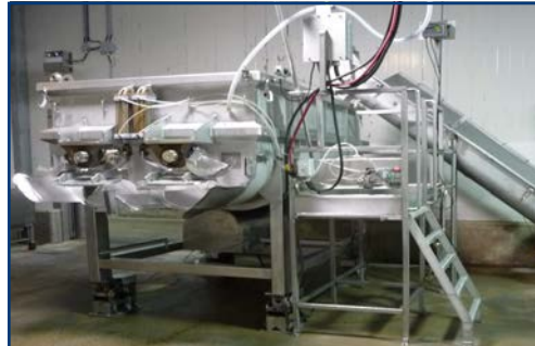
AMFEC DUAL SHAFT PADDLE MIXER W/LOAD CELLS