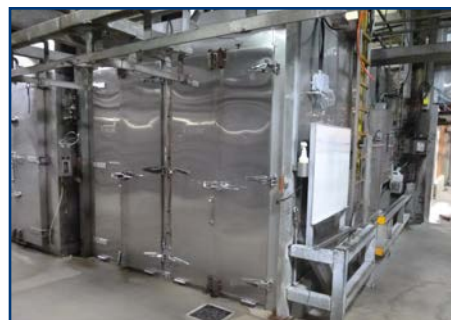
VIRGINI SMOKEHOUSE (1 OF SEVERAL)