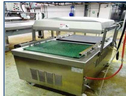
MULTIVAC VACUUM PACKAGING MACHINE, MODEL C500, (1 OF 2)