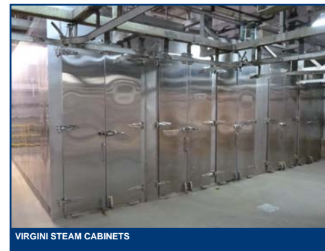
VIRGINI STEAM CABINETS