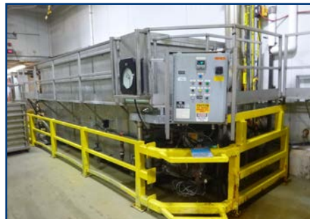
RIN HAM COOKING TANK, C/W ECLIPSE 1MM BTU/HR BURNER