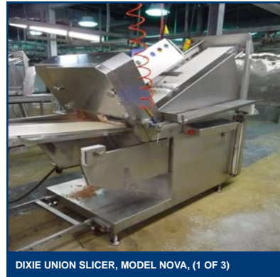
DIXIE UNION SLICER, MODEL NOVA, (1 OF 3)