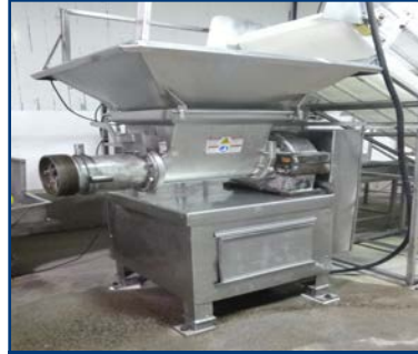
WEILER GRINDER, MODEL 1109