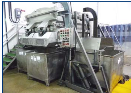
BOLDT DUAL SHAFT PADDLE BLENDER/MASSAGER, MODEL BBV-34-P-0040