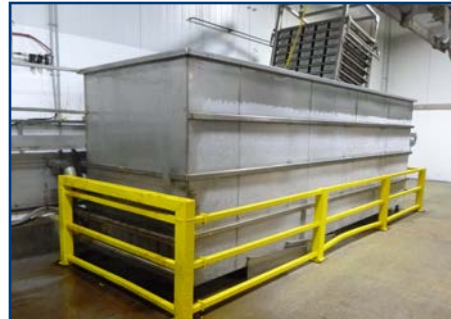
RIN HAM COOLING TANK