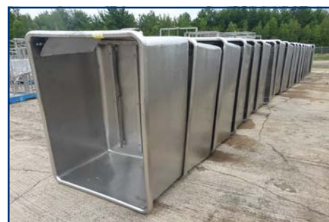
S/S TANKS, (PARTIAL VIEW)