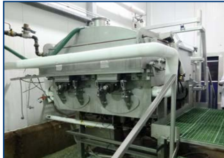
MTC DUAL SHAFT STEAM COOKER/MIXER, MODEL SC-3000