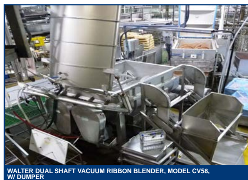
WALTER DUAL SHAFT VACUUM RIBBON BLENDER, MODEL CV58, W/ DUMPER