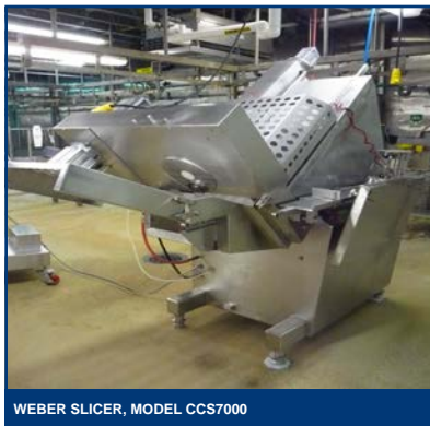
WEBER SLICER, MODEL CCS7000