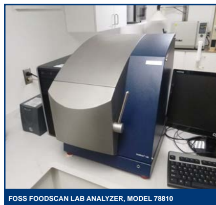
FOSS FOODSCAN LAB ANALYZER, MODEL 78810