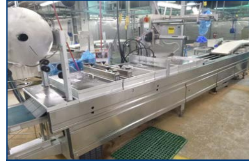
MULTIVAC VACUUM PACKAGING MACHINE, MODEL R530