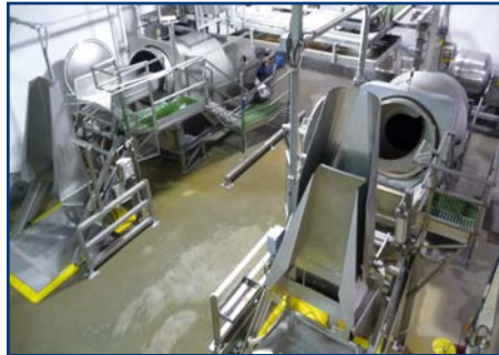
(2) CHALLENGE VACUUM TUMBLERS, MODELS MM-3-TC, &amp; MP-3