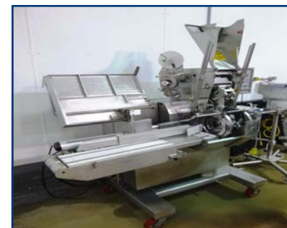
POLY-CLIP SYSTEM CLIPPER, MODEL ICA-8700, (1 OF 2)