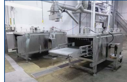
LIQUID CARBONIC IQF TUNNEL FREEZER, MODEL JE-U3A