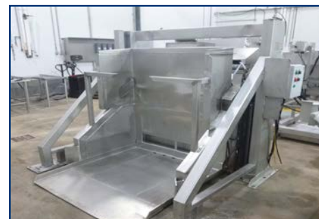
HYDRAULIC BIN DUMPER, (1 OF 20)