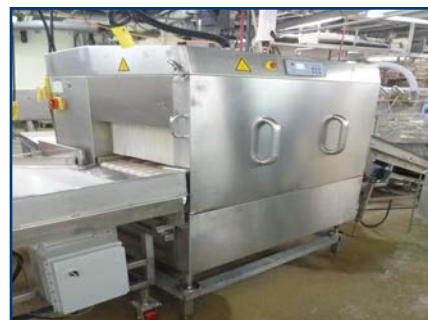
MULTIVAC SHRINK TUNNEL, MODEL SE115