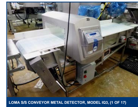
LOMA S/S CONVEYOR METAL DETECTOR, MODEL IQ3, (1 OF 17)