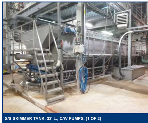
S/S SKIMMER TANK, 32' L., C/W PUMPS, (1 OF 2)