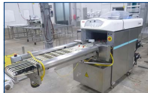
ULMA TRAY WRAPPER, MODEL SUPER CHIK