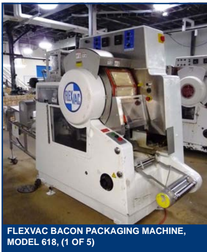
FLEXVAC BACON PACKAGING MACHINE, MODEL 618, (1 OF 5)