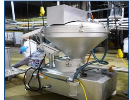
HANDTMANN STUFFER, MODEL HVF95